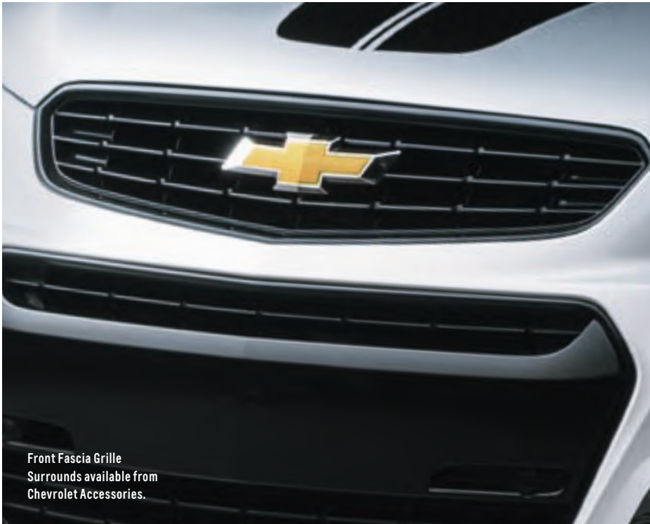
Front Fascia Grille Surrounds available from Chevrolet Accessories.