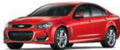
RED HOT 2