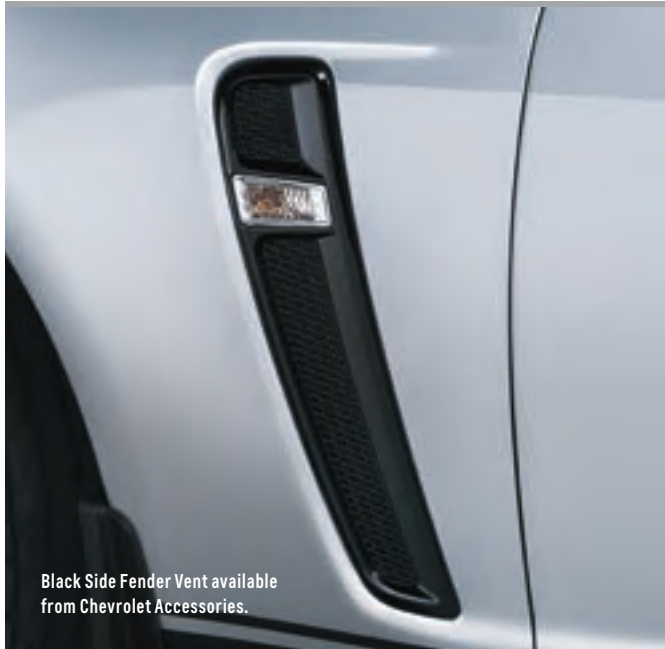
Black Side Fender Vent available from Chevrolet Accessories.