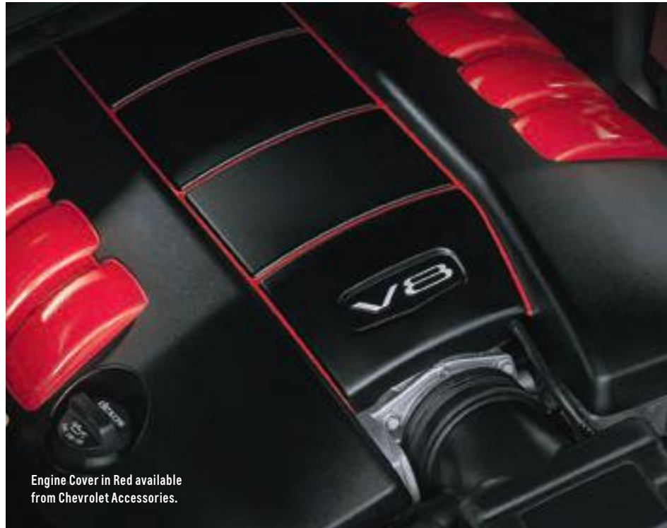
Engine Cover in Red available from Chevrolet Accessories.