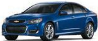
SLIPSTREAM BLUE METALLIC