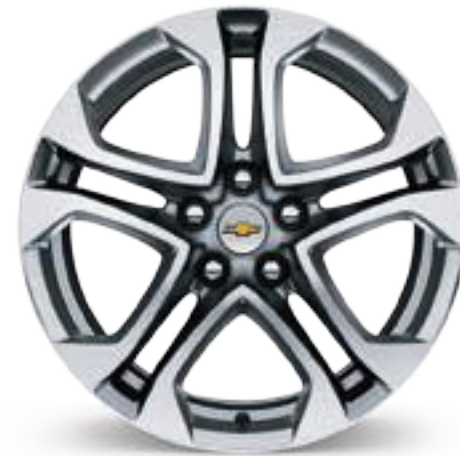
19" Ultra Bright Machined-Face Cast-Aluminum 2 (Standard)