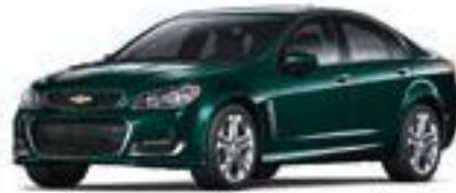
REGAL PEACOCK GREEN METALLIC