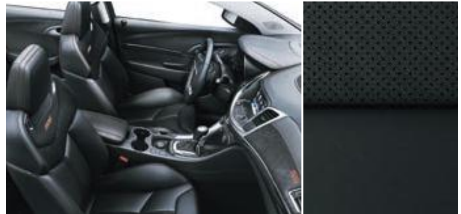
Jet Black Leather Appointments with Red Accent Stitching