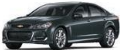
NIGHTFALL GRAY METALLIC