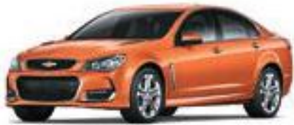
ORANGE BLAST METALLIC 1