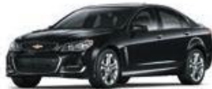
PHANTOM BLACK METALLIC