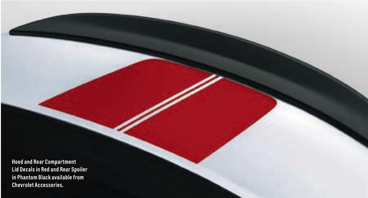
Hood and Rear Compartment Lid Decals in Red and Rear Spoiler in Phantom Black available from Chevrolet Accessories.